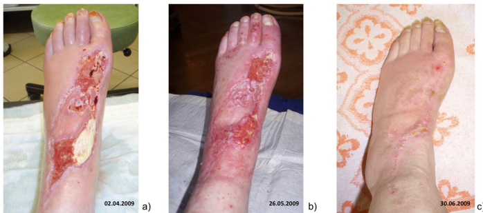
Figure 3: Follow up of the case two.

Comment: Together with the anti-inflammatory and vasodilating features of procaine the known problem of metabolic alkalosis in patients with chronic kidney diseases and after transplantation can be solved by the combination with sodium bi-carbonate [92,93].